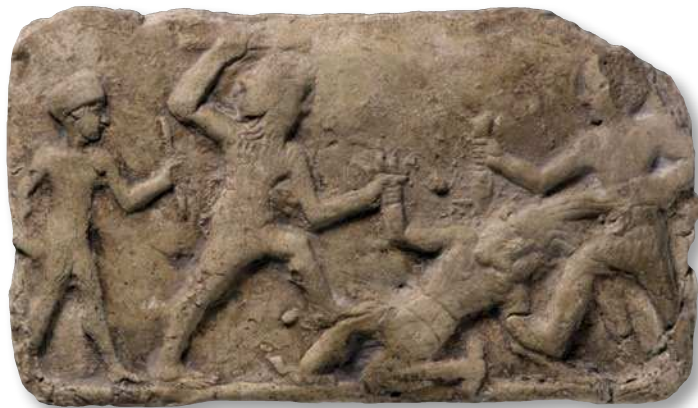
Uruk's reach was international in scope. This terracotta relief shows the city's king, Gilgamesh, and his companion Enkidu killing Humbaba, the guardian of the forest, in what is now Lebanon.

Much of what we now take for granted about city life—the crowded streets, spacious public buildings filled with written records, busy markets selling exotic goods, and peaceful parks—took shape here. Some of the earliest attempts at organized taxation, mass production of goods, sustained international commerce, large-scale public art—as well as the systematic exploitation of women and slaves—can be traced to Uruk. There is little doubt that the earliest system of writing matured here. Uruk was also the setting for the world's oldest surviving epic, dating from the third millennium B.C. This tale centered on the city's god-king Gilgamesh, who is also mentioned as a ruler in