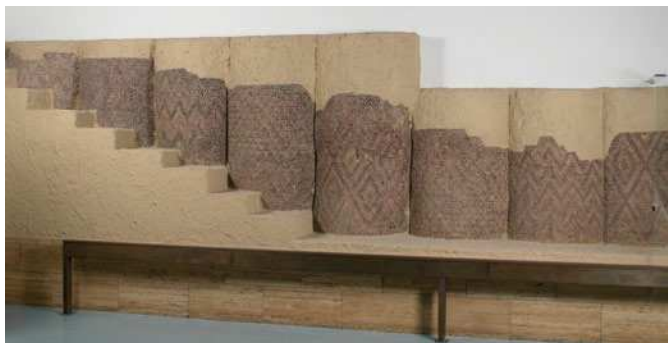
Colorful mosaic cones decorate the wall (top) of a 5,000-year-old temple southeast of the Eanna district of Uruk in a photo taken on-site in 1931 or 1932. A reconstruction of a similar mosaic wall (above) can be seen at the Pergamon Museum in Berlin.

sort of administrative documents in the same cuneiform script. “When compared to the Eanna temple, even the Vatican looks like an almost ephemeral institution,” he says.