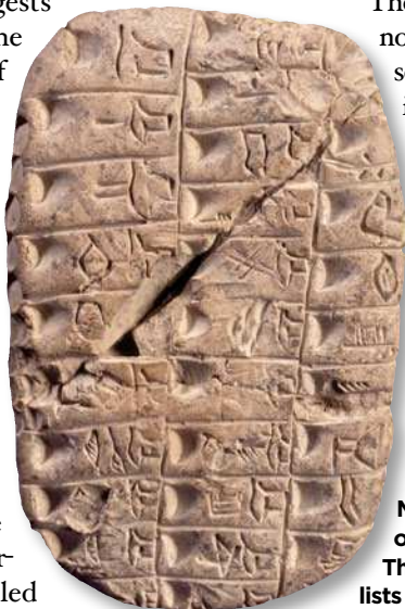
Many of Uruk’s cuneiform tablets written over several millennia concern temple supplies. This example, dating from about 3000 B.C., lists 58 pigs.

There are, however, hints that Uruk’s influence was not all benign. Archaeologists have found that the settlement of Hamoukar in eastern Syria went up in flames, possibly during an armed conflict with an unknown enemy in the fourth millennium B.C. And Tell Brak, a massive site in Syria that may have rivaled Uruk in size and sophistication in the middle of the fourth millennium B.C., shows evidence of a steep decline at the same time that Uruk-style artifacts begin to appear at the site. Some scholars believe that Uruk, or its allies, may have been involved in the collapse of the rising proto-cities of northern Mesopotamia.