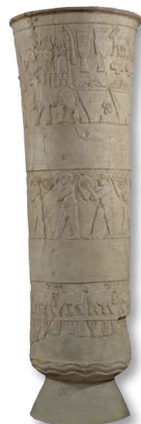
Artifacts from the 4th millennium B.C. city, clockwise from top left: A cylinder seal and its modern impression depict a priest-king surrounded by a herd of feeding cows, symbols of the goddess Eanna; an alabaster cult vessel known as the “Warka Vase”; and well-preserved examples of some of the world’s first mass-produced pottery.