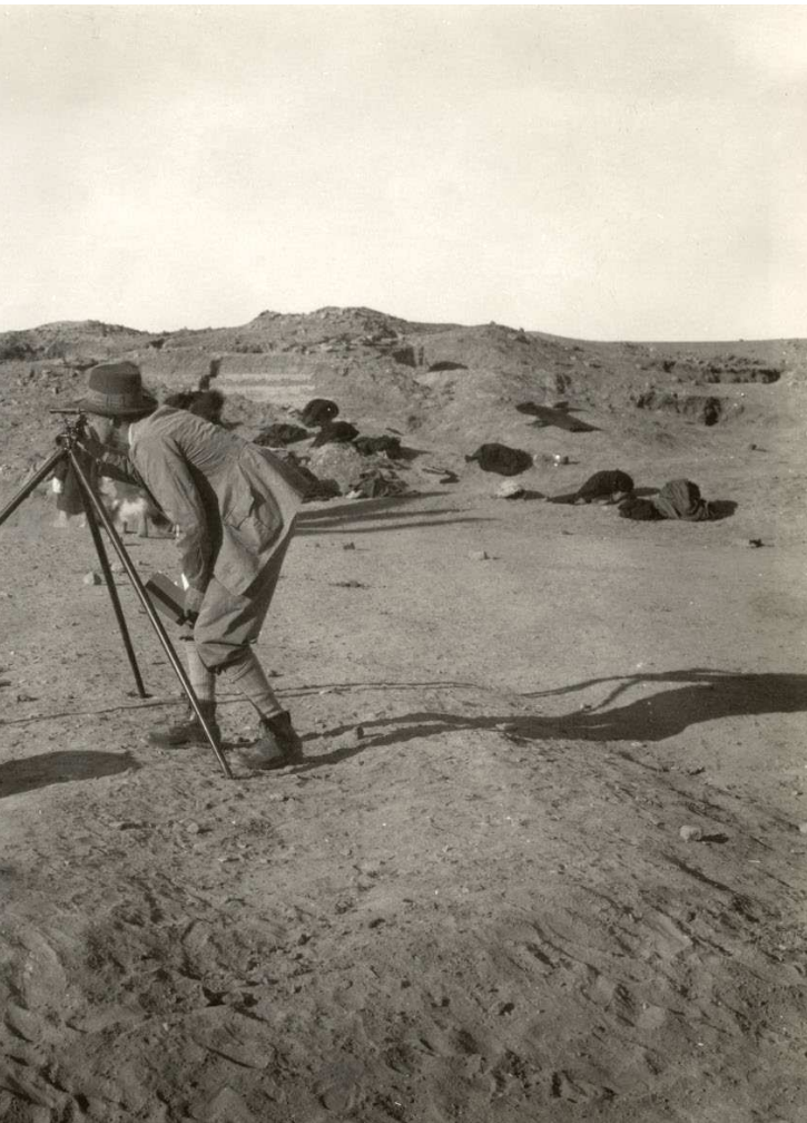
Excavations spanning a century, seen in a 1929 or 1930 photo (above) and in a more recent one, from 1989 (left), have been conducted at Uruk by the German Archaeological Institute.

most important archaeological sites, it is also one of the most challenging to access and understand. “I was unable even to make an attempt to reach the remarkable ruins,” complained Henry Austen Layard, an early-nineteenth-century British explorer who came to the region. Warring tribes at the time of his visit made the site, located between Baghdad and Basra on the vast Mesopotamian plain, inaccessible. And though now locked in desert as a result of shifting rivers, recent drought, and irrigation schemes, the region not so long ago was a treacherous land of trackless marsh that would have been familiar to Uruk’s earliest inhabitants. “The greater part of the country below ancient Babylon has now been for centuries one great swamp,” Layard added.