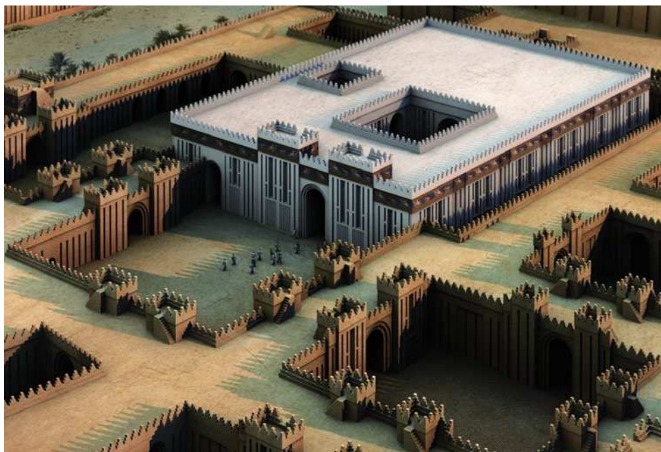
A 3rd-2nd century B.C. Seleucid temple to Anu, the god of the sky, seen above in a recent digital reconstruction, dominated the Kullaba district of Uruk long after the city's political and economic importance had waned.

The final blow came not from the shifting Euphrates, but