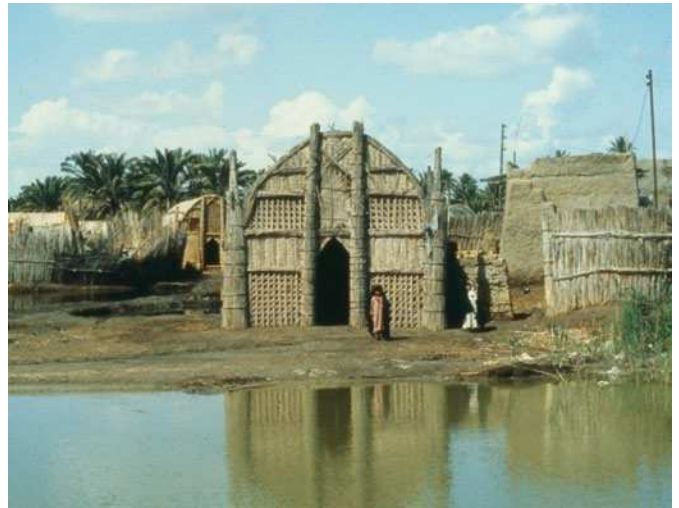
Reed huts like this one, still common in southern Iraq, likely are similar to the first dwellings in Uruk. Later inhabitants built mudbrick homes as the city’s population swelled in the late 4th and early 3rd millennia b.c.

The first Westerner to excavate Uruk was Layard’s contemporary, British geologist William Loftus, who worked there briefly in 1850 and then again in 1853. Loftus believed he had found Ur of the Chaldees, hailed as Abraham’s home in the Bible. But his investors were not impressed, so he abandoned Uruk. He died on his return home, never knowing that he had discovered the fabled home of Gilgamesh.